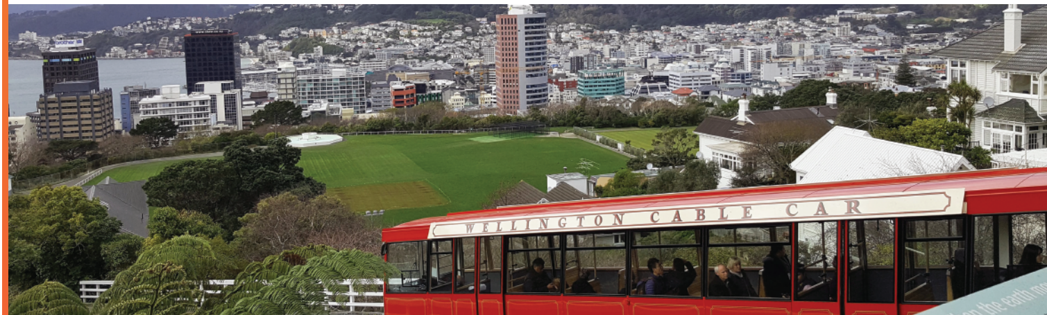
Wellington is New Zealand's centre of government and the world's southernmost capital city.

Capital, Coast and Hutt Valley district provides a range of specialist services including neurosurgery, oncology, neonatal intensive care and community-based services including district nursing, rehabilitation services, alcohol and drug services, social work and home support services to a population of around 900,000 people.